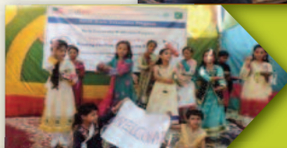
Children performing during International Literacy Day celebrations at GGPS Haji Lal Bux Shaikh, Larkana.