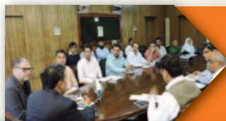
USAID delegation attending second DST meeting in Sukkur along with senior level officials from partner organizations chaired by the Deputy Commissioner.

*Seven schools are completed, of which, 4 schools are handed over to School Education Department, Government of Sindh.