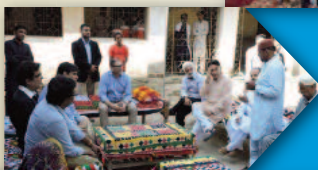
USAID mission during meetings with Community in Village Dodanko, Sukkur.