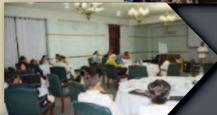
CMP Year-4 Work plan meeting in Karachi.